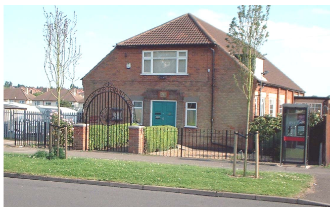
The Office before the phone box was removed

We would like to take this opportunity to welcome all new babies and new tenants to the estate.