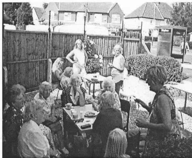
Catching up on the latest!

MEMBERS ENJOYING A CHAT DURING THE COFFEE MORNING HELD IN AUGUST. This was the second summer coffee morning held to give neighbours a chance to meet and to put their entries in the 'memory book'.